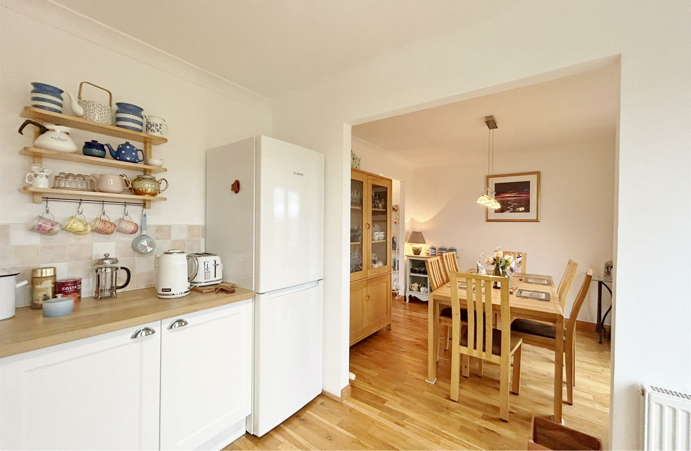
Bryncerdd Shiskine, Isle Of Arran, KA27 8EW