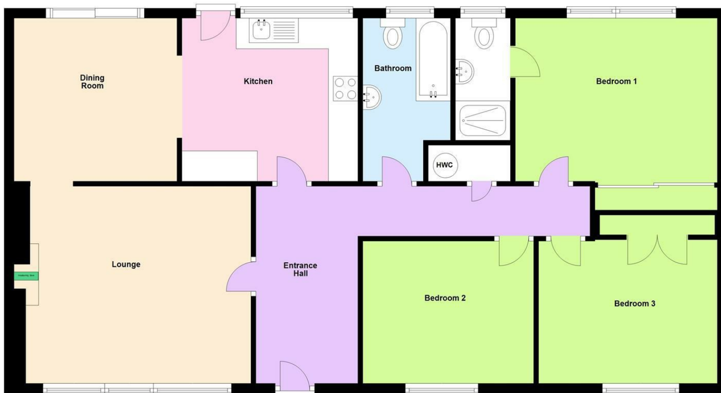
Bryncerdd Approx. 105.7 sq. metres (1138.0 sq. feet)

FLOOR PLAN NOT TO SCALE FOR GUIDANCE ONLY Plan produced using PlanUp.